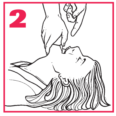
Open the airway and check the mouth for objects. Remove the obstructing object only if you see it.