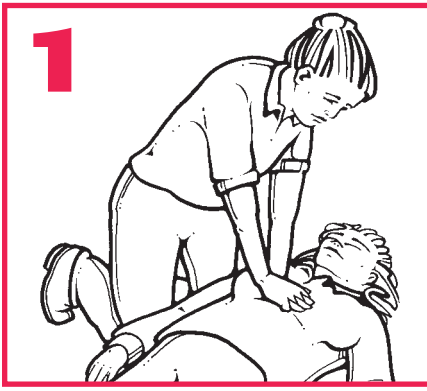
Give 30 compressions pushing down AT LEAST 2 inches on the center of the chest Place one hand on top of the other. Push hard.

Send someone to call 911 and get the Automated External Defibrillator (AED). IF YOU ARE ALONE, perform 5 sets of 30 compressions and 2 breaths before leaving to call 911. Follow these steps.